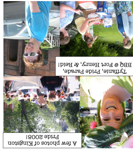
A few photos of Kingston Pride 2008!